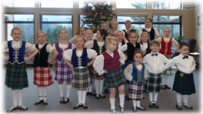
"Scottish Highland Dancers"