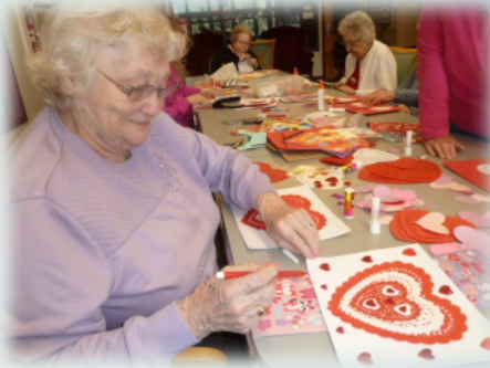
Arts & Crafts