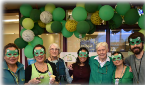
Residents and Staff Wore Green to celebrate Leap Year Day 2020