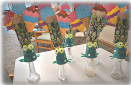
Extra day to be crafty....Residents made frog ice cream centerpieces