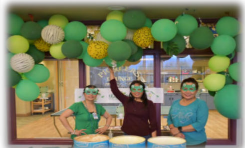
Serving one extra scoop of ice cream