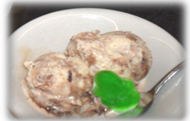
Extra scoop of ice cream with leaping gummy frogs