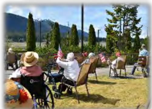
Photos taken at JPH back lawn.