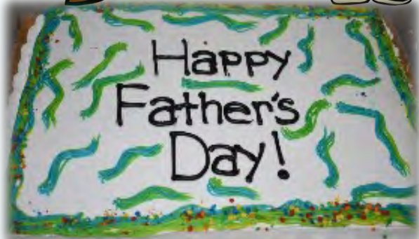
Cake sponsored by St. Brendan's Church