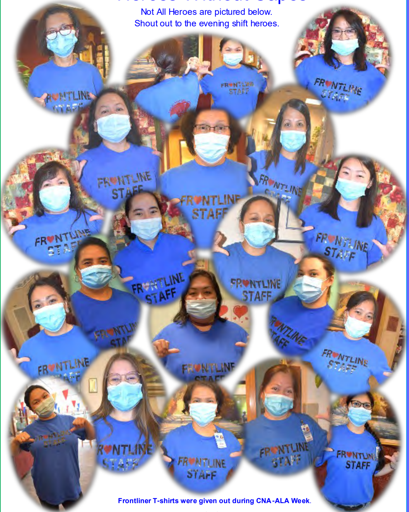
Frontliner T-shirts were given out during CNA-ALA Week.

Not All Heroes are pictured below. Shout out to the evening shift heroes.