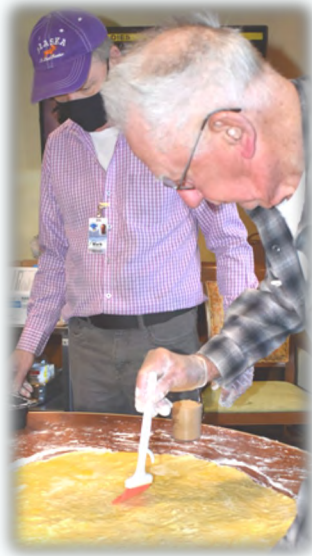
2. Baste butter on top of dough