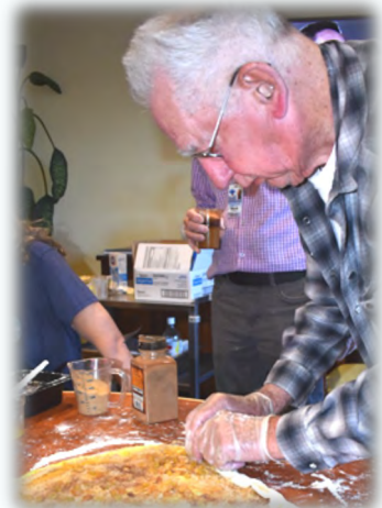
6.. Fold dough at the edge