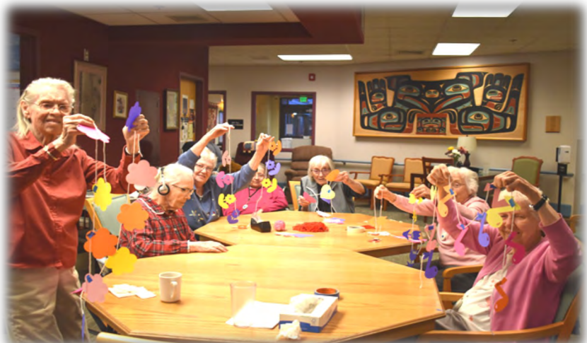
Evening Arts & Crafts ( 10 )