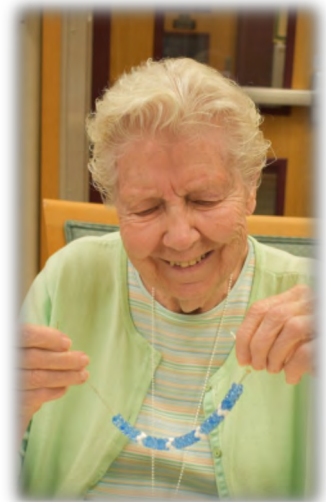
Sally strings up beads