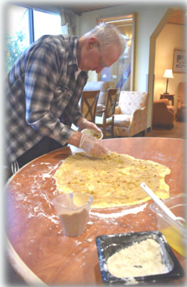
4. Sprinkle golden raisins