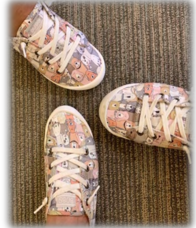
The "Bobs" Shoe Girls