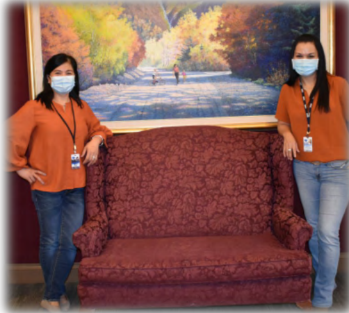
Staff who dress alike