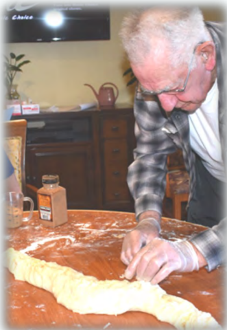
7.. Begin rolling dough to the end