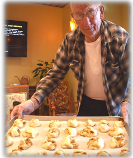
Learn how to make Ron's cinnamon rolls