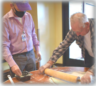
1. Roll Dough evenly flat