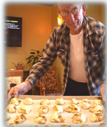
9. Let it sit & rise and bake for 10 mins.