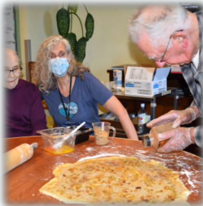
5. Sprinkle Cinnamon