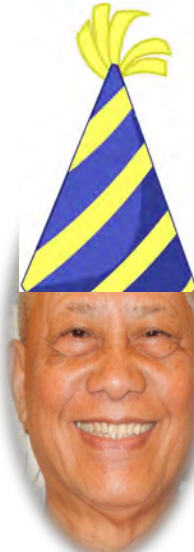
Panting Ttudud, 9/12