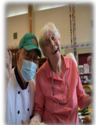
Phyllis: Great talks!