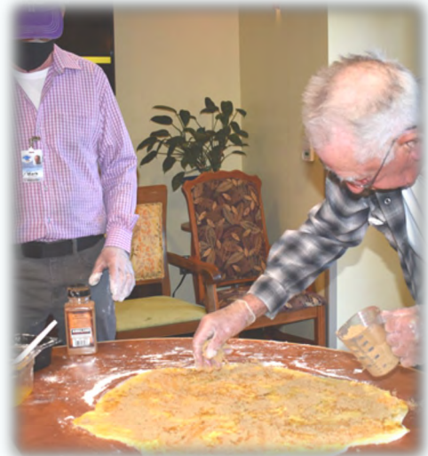
3. Sprinkle brown sugar