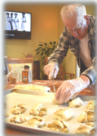
8. Cut dough into pieces