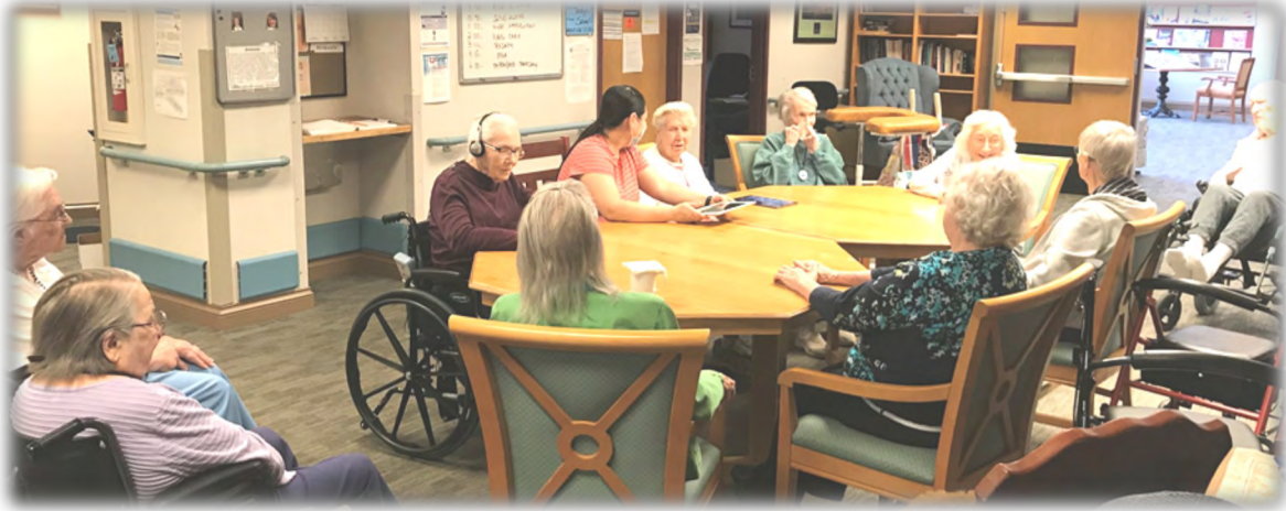
Throwback Thursday , a reminiscing activity always brought a big crowd and interesting topics.