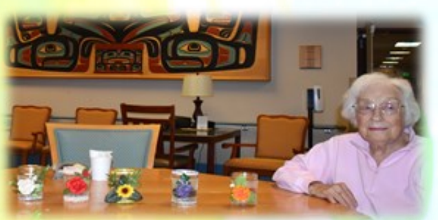
Bonnie happy with their mason jar candle holder