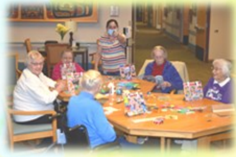
The making of "Best of Alaska" Photo Frames