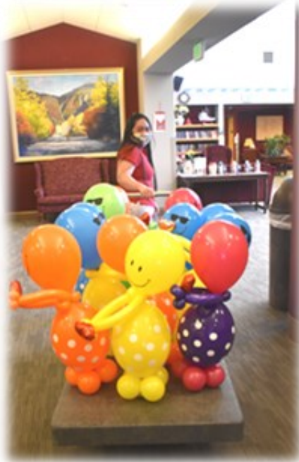
Let delivers Valentine's Day balloons to Residents