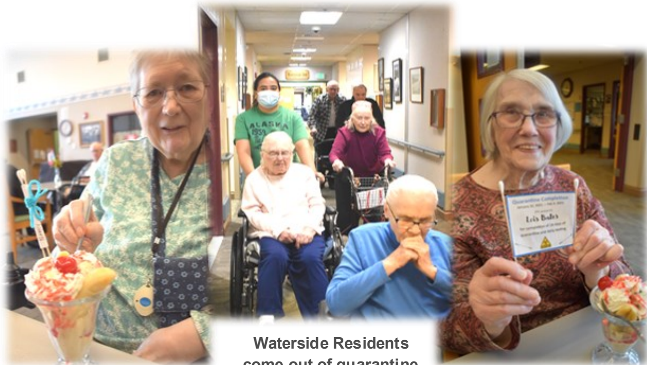
Waterside Residents come out of quarantine