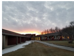
Sunrise from Mountain View neighborhood

The wind has definitely been "shouting like a giant" this last week, and causing power to flicker as well and some adventures on the road for our drivers and those of us on a bicycle. It was another eventful month here at the AVPH; we currently have the highest number of veterans (54) in our history. We also are continuing to serve our local Pioneers as well and have been able to admit a mix of veterans and pioneers this month.