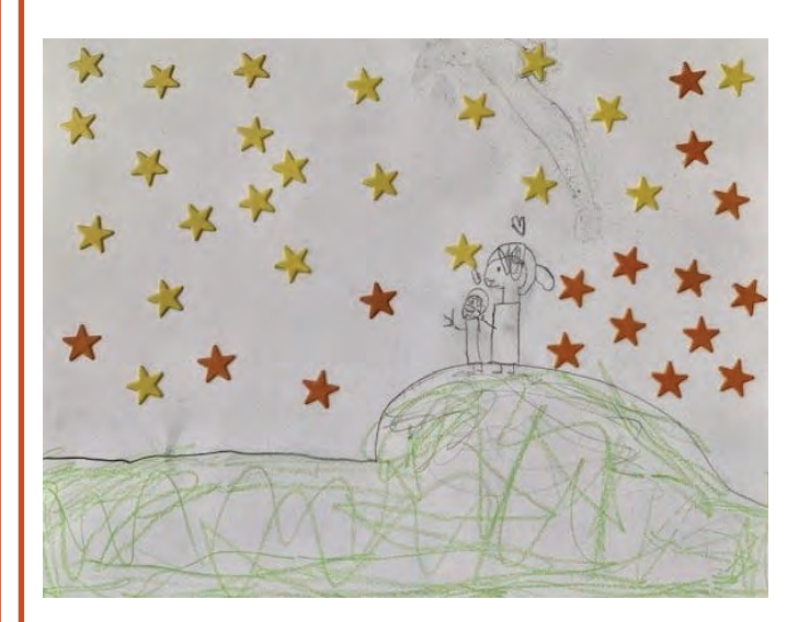
"Stars Nighttime Sleepover" By Lydia