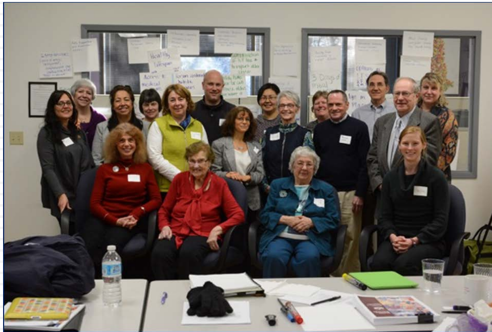
The Alaska State Plan for Senior Services Advisory Committee